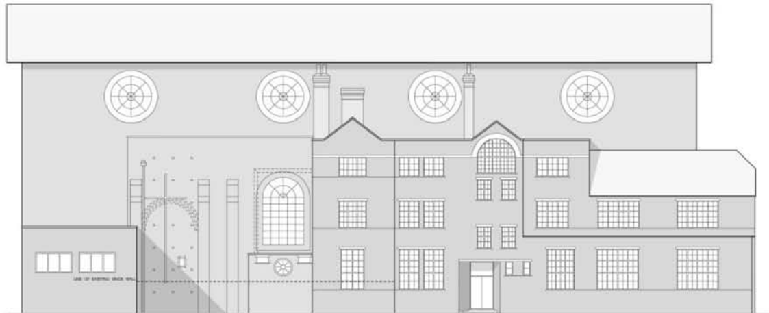
EAST ELEVATION OMHR 1:100

Within this shadow a small space has been set aside to create the garden. Sitting between the towering walls of the church and a solid brick wall that separates it from a public park, the area is shaded and secluded.